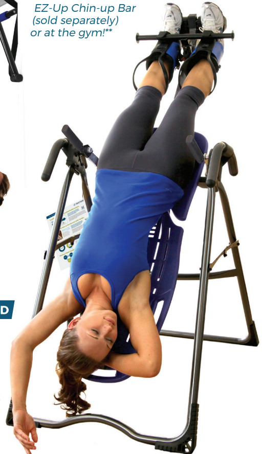
EZ-Up Gravity Boots with Adapter Kit