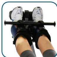
EZ-Up Gravity Boots XL